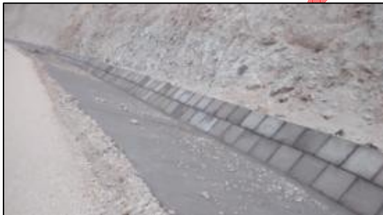
Photo 5: Drainage structure construction.