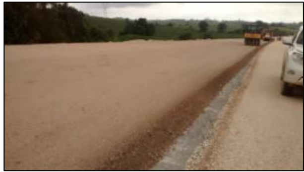
Photo 2: Sub-base works ongoing on a section of the alignment.