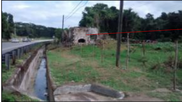
Photo 4: Water wheel and barb wire fence placed around it.