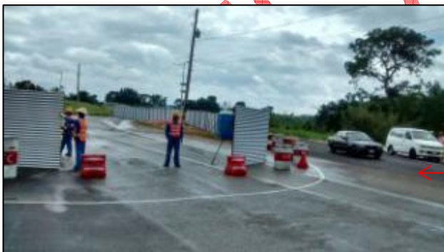
Photo 1: Construction works at the Golden Grove Roundabout.