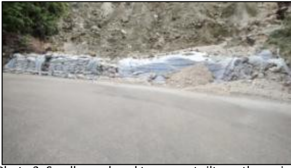
Photo 3: Sandbags placed to prevent silts on the main road.